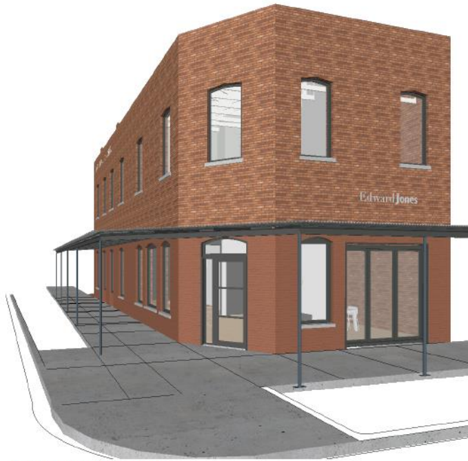
1 SOUTHEAST PERSPECTIVE