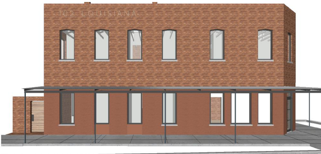
2 SOUTH ELEVATION